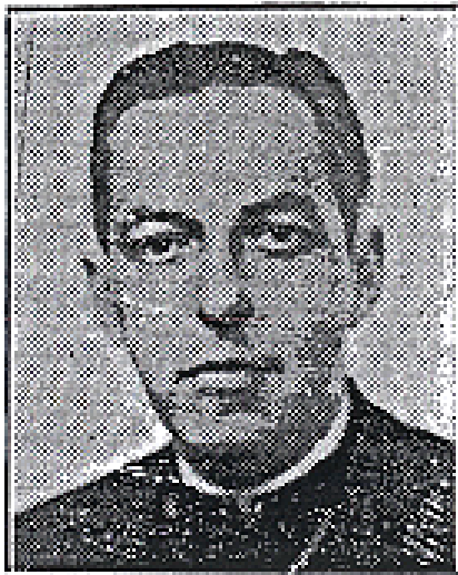
THE RT. REV.